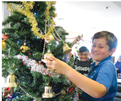
Andersons Hall at Peacehaven has been given a Christmas makeover by St Andrews Young Achievers

a donation towards the tree and charity they choose. The Waihopai Lions Club has opted to support Family Works with its tree and all trees are currently on display until Christmas.