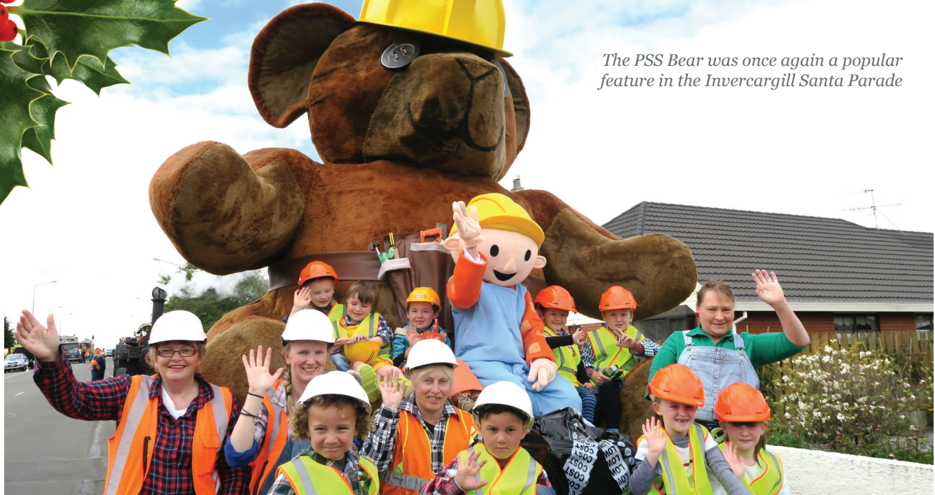
The PSS Bear was once again a popular feature in the Invercargill Santa Parade