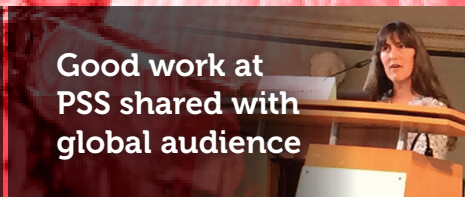
Good work at PSS shared with global audience