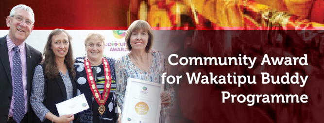
Community Award for Wakatipu Buddy Programme