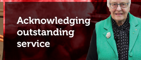
Acknowledging outstanding service

PLUS Pēpi-Pods offer safe sleep solution • Staff achievements and happenings • Relative and Family Survey and more