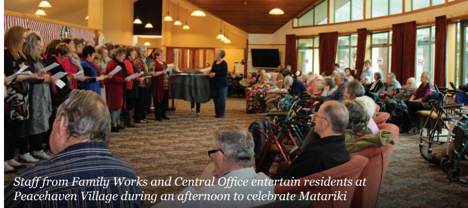
Staff from Family Works and Central Office entertain residents at Peacehaven Village during an afternoon to celebrate Matariki