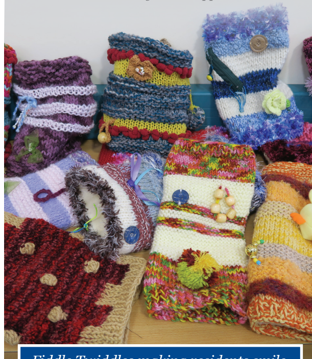
Fiddle Twiddles making residents smile